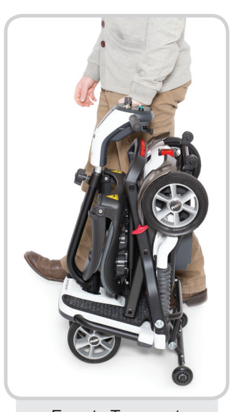
Easy to Transport

Ready for transport and easily folded, the 4-wheel Quest Folding Scooter is perfect for the active lifestyle. Offering great performance indoors and out at a maximum speed of 6 km/h (4 mph) and a range per charge of up to 20 km (12.5 miles), the Quest Folding Scooter provides a comfortable and convenient ride. It is super portable and is a great space saver that adjusts to fit perfectly inside any closet, corner, or vehicle trunk. The Quest Folding Scooter is sleek, stylish, and extremely easy to operate, making it the perfect travel mobility